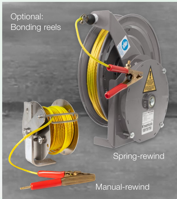
Optional: Bonding reels