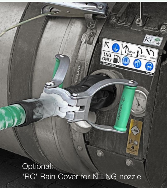
Optional: 'RC' Rain Cover for N-LNG nozzle