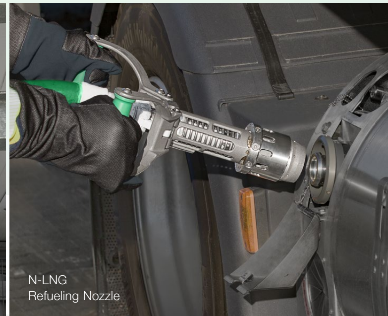
N-LNG Refueling Nozzle