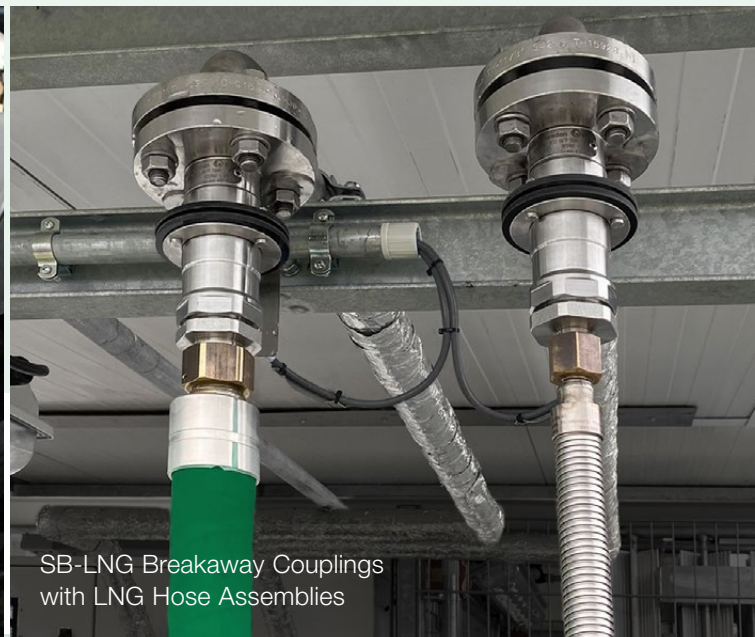
SB-LNG Breakaway Couplings with LNG Hose Assemblies